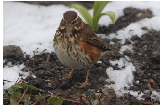
Redwing

This year February is the perfect time to sow broad beans. Hardy and dependable, they cope well with cold soil and even snow, using the slower conditions to build strong roots. Sow now, and they'll be ready to surge into growth as soon as the weather softens. Trust the cold – the earth is working even when it looks asleep.